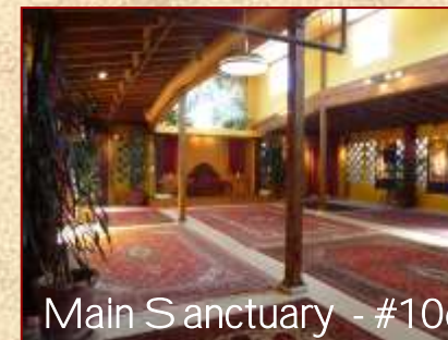
Main Sanctuary - #106