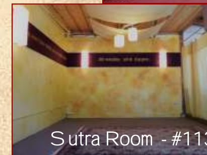
Sutra Room - #113

This carpeted workshop room has a very warm and cozy feeling, with silk draped down the walls and on the ceiling. It has high ceilings and natural light—including a 10' sliding glass door opening onto a patio. The meeting space is perfect for movement workshops for up to 16 people. It can seat up to 25 (conference seating) and has a separate kitchen area for preparing snacks & tea.