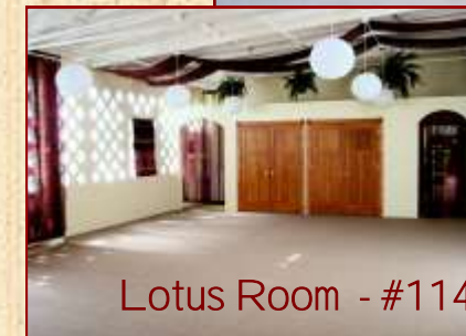
Lotus Room - #114

This room has high ceilings, natural light, skylights that open, and carpeting. The space is adorned with Chinese art and large plants. The meeting hall is ideal for movement workshops up to 30 people. It can seat up to 70 (conference seating). It has a small corner kitchenette.